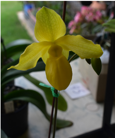
Paph. Golden Dollar