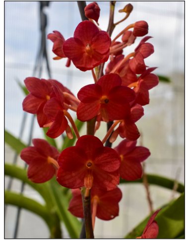
V. Pralor ( V. Medea X V. miniata ) has 25% V. curvifolia in its lineage.