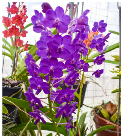
V. Pine Rivers ( V. Peggy Foo X V. coelestis )