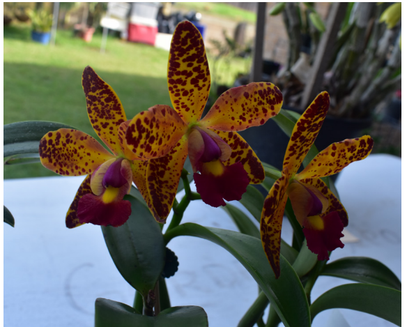
C. Jungle Gem