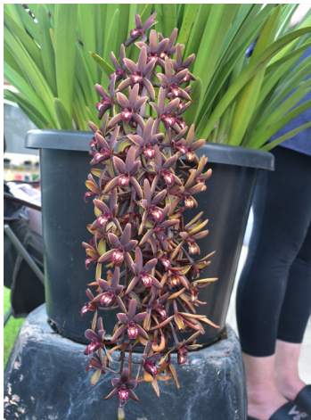
Cymbidium Little Black Sambo ( C. madidum X C. caniculatum ) is a primary Australian hybrid.