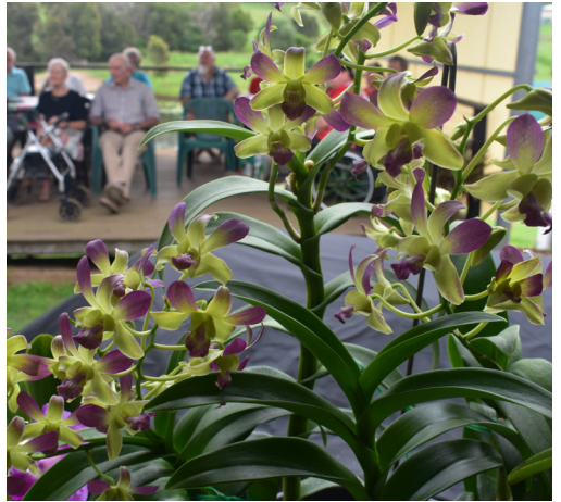
Den. Chao Praya moonlight 'Sweet Fragrance'