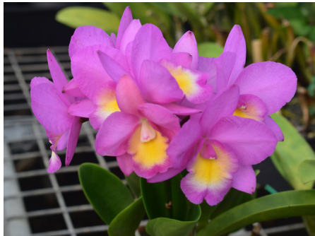
C. Why Not Walk 'Leanne'

These were some of the plants flowering in Jim's shadehouse.