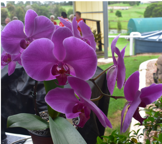
Phal. unknown (Hervey Bay)