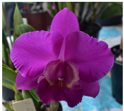
C. Elusive Case 'Echo'

The next S.T.O.C.Q. meeting, which will include the AGM and normal meeting of this council is due to be held on the 12th February 2022 in the Albert Bowls Club, Gympie.