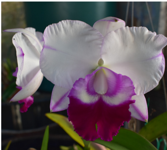
Rlc. Memoria Anna 'Balmores'

Flowering at the moment, this plant was bought from Rosella Orchids Nursery several years ago. It has a lovely flat profile and vertical alignment with beautiful sepals and labellum. Just the tips of the petals are slightly recursive. It has a lovely fragrance. Its parentage is Cattleya Mem. Robert Strait × Rhyncholaeliocattleya Good News.