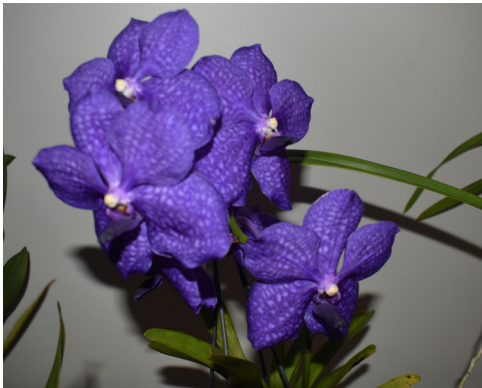
Vanda Pachara Delight