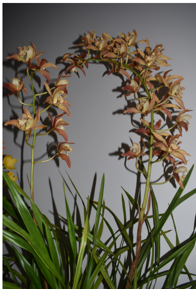
Cymbidium traceyanum 'Doris'