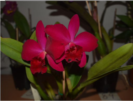
Slc. Love Castle 'KK'