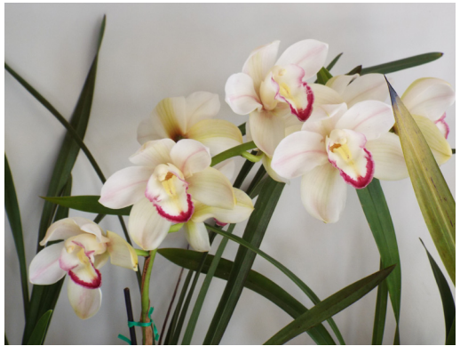
Cym. Valley Splash 'Awesome'