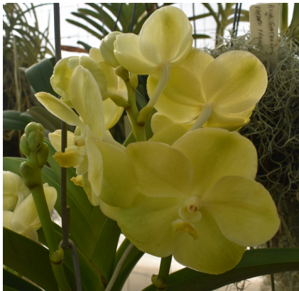
Vanda Somsri Gold