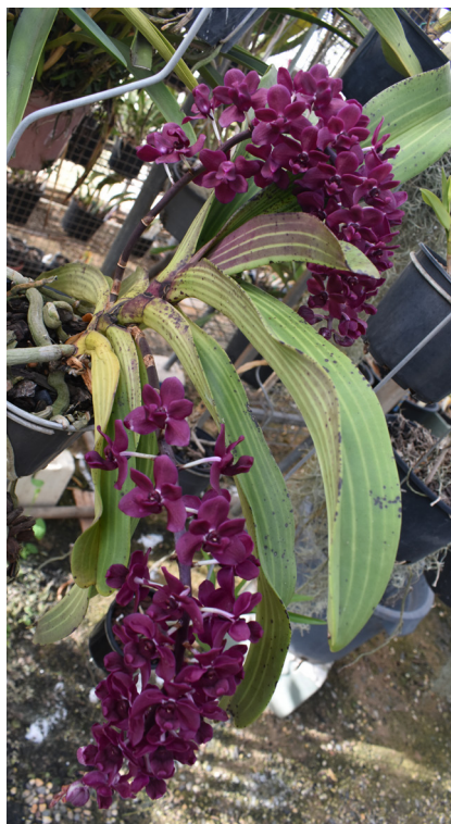
Rhyncostylis Gigantea Orange (yes the actual color is closer to maroon)

pollinated by Eulaema meriana a solitary bee endemic to the region.