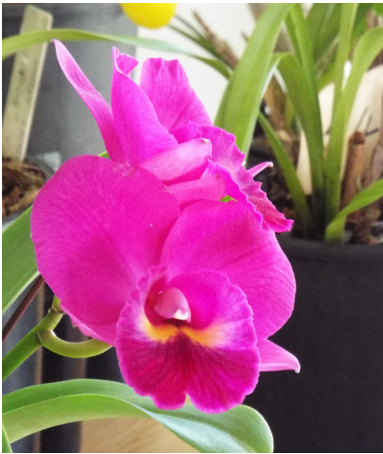
C. Hsyng Aloha 'CH Super'