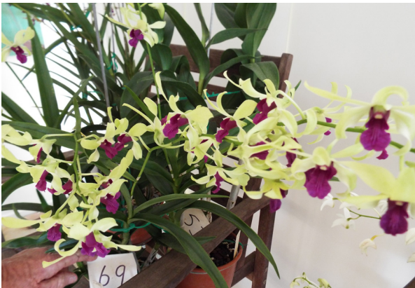
Den. Genting Lipstick