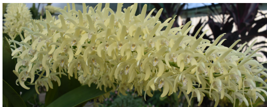
Corrie Sheafe's Den. speciosum curvacaule this spring.

The flower bracts can have multiple clusters with up to 100 flowers and seldom less than a dozen.. My plant (pictured above) is 8yrs old, grown from a cutting and has been flowering for 3yrs, each year the number and size of the bracts increases. For its weight, Vanilla is 2nd only to Saffron as the world's most expensive plant condiment.