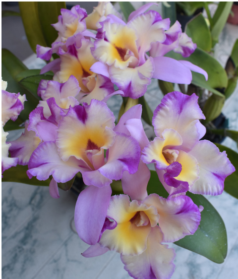
C. Momilani Rainbow 'Ava'